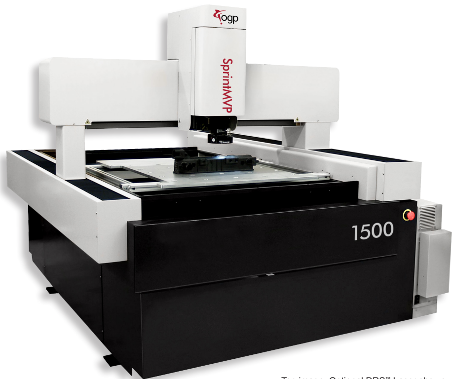
Top image: Optional DRS™ Laser shown.