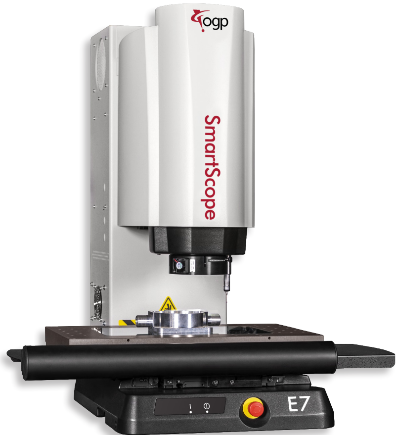
Shown with optional Touch Probe.