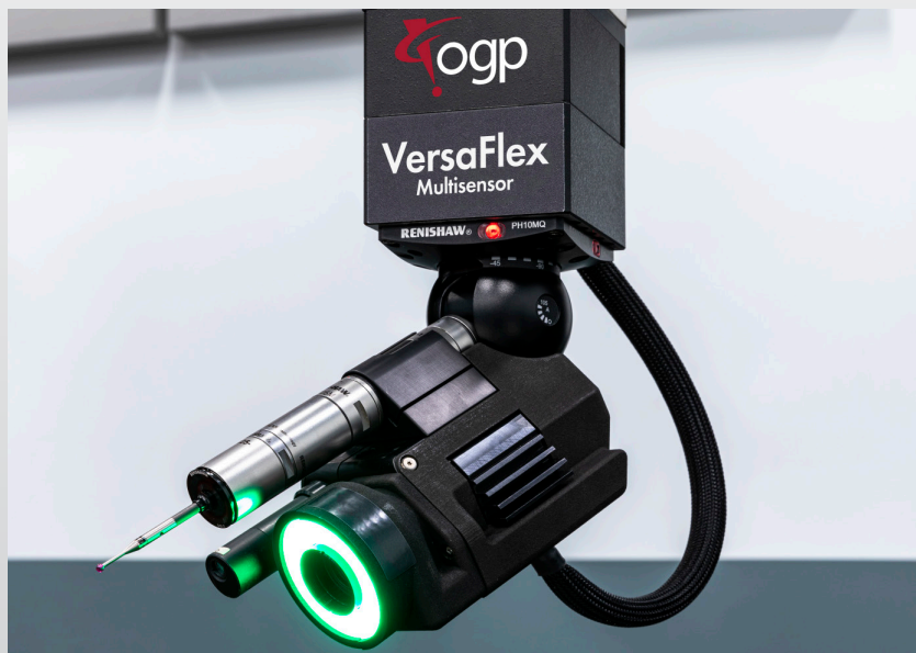
VersaFlex Articulating Sensor

FlexPoint is offered in three X,Z base configurations, each with a choice of Y-axis range to suit a wide variety of manufacturing needs.